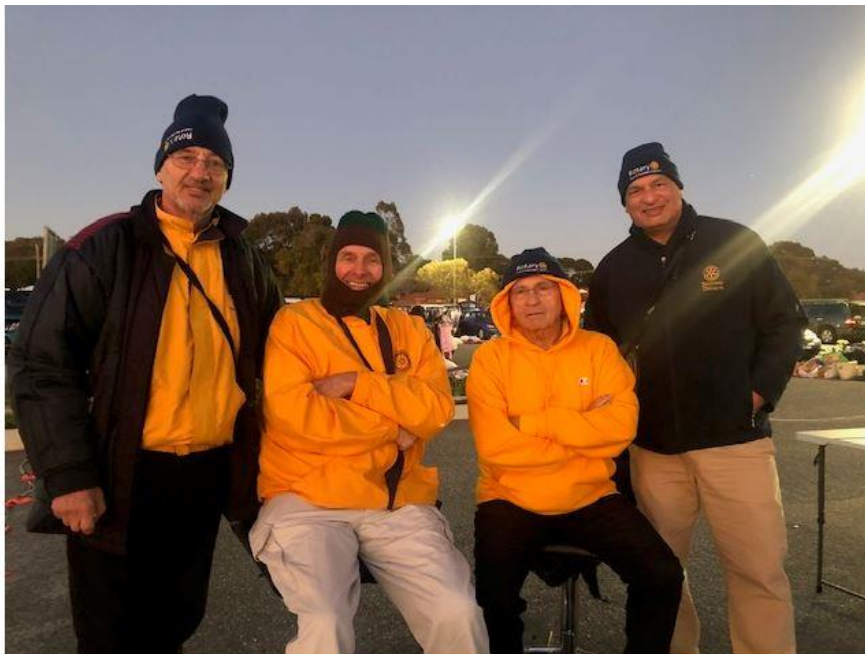
Chilling out at the bring and buy