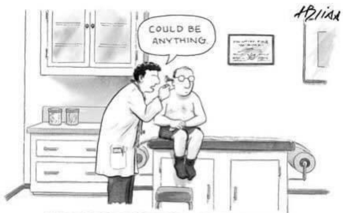
WAY TOO GENERAL PRACTITIONER