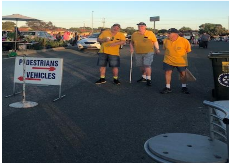
Nice shorts and legs